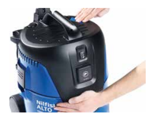
Push&Clean semi-automatic cleaning system, for quicker and easier maintenance.