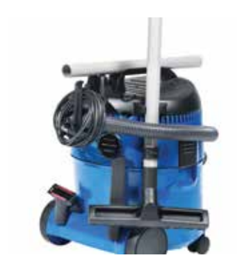
Accessory storage and tool deposit makes transport and storage easy and reliable.