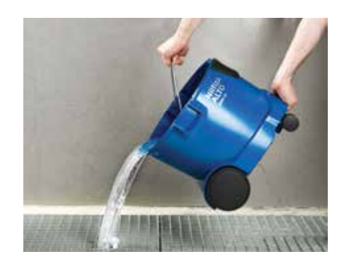
Integrated container handle makes disposal and lifting easy and convenient on AERO 21 and 26 models.