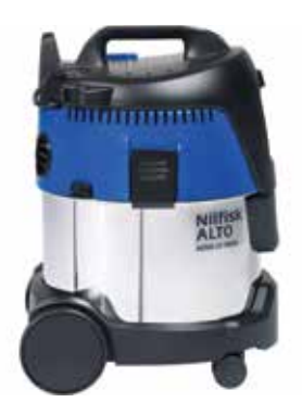
INOX models come standard with stainless steel collection container.