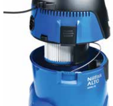
Long-lasting, washable PET filter retains to 1.0 micron.