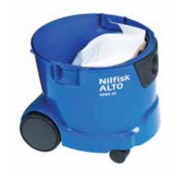
Fleece bags available for easy clean-up of debris.